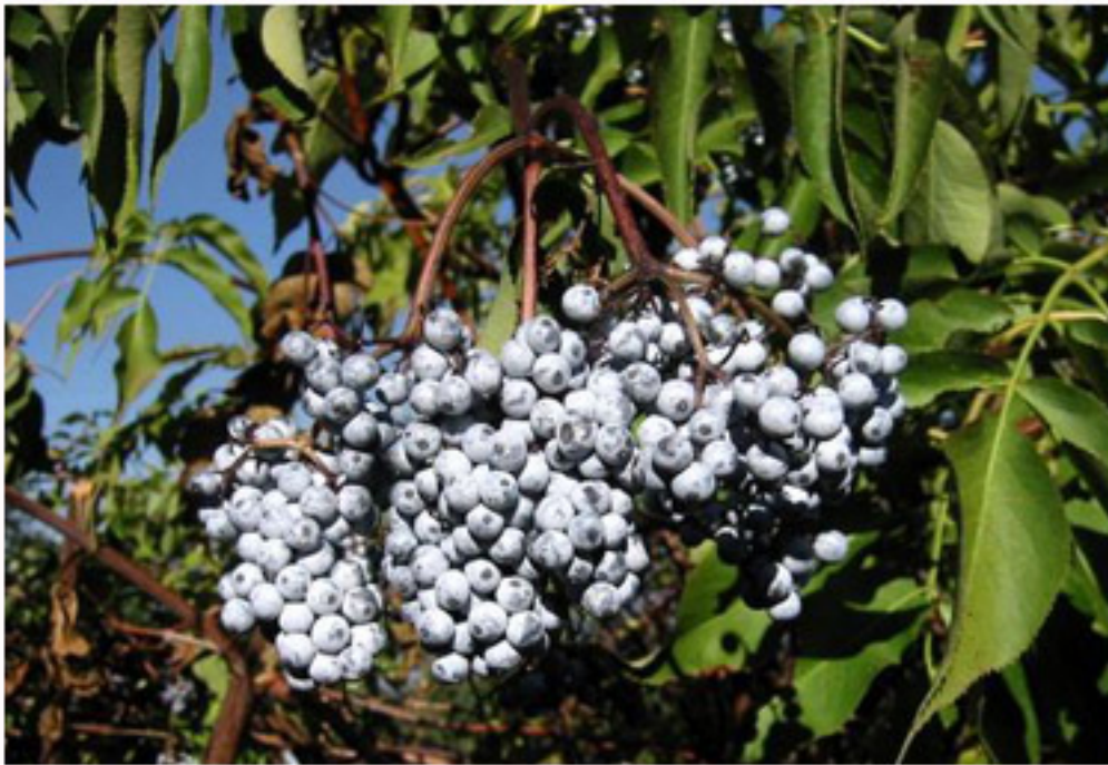
Name/Species: Blue Elderberry, Sambucus

Range: From Canada to Mexico and west from Texas/Montana