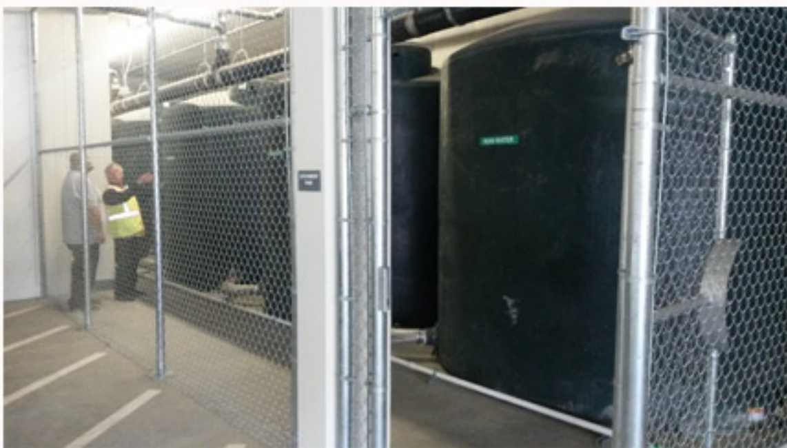
After their installation Bobby trained building maintenance how to operate the tanks.