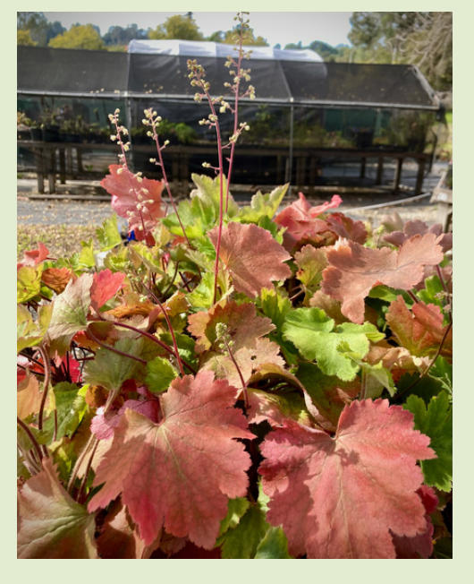
Maianthemum stellatum (False Solomon Seal) 1 Gallon @ $15.95