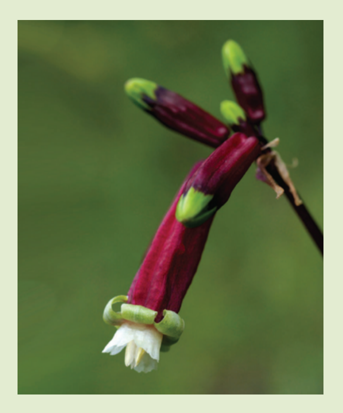
Dicentra formosa (Bleeding Heart) 1 Gallon @ $15.95