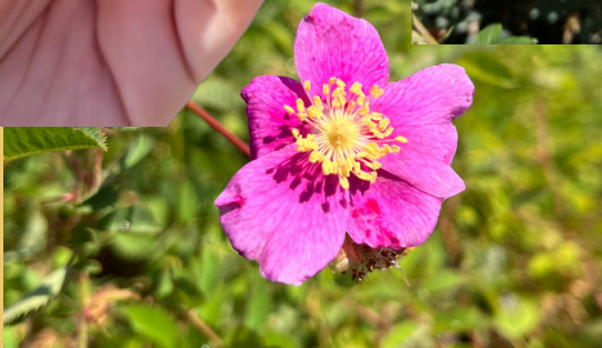
Rosa californica (California wildrose)