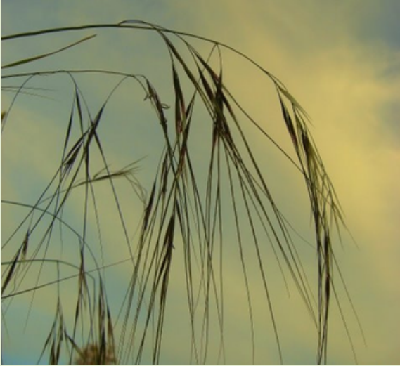
Stipa pulchra (Purple Needlegrass)