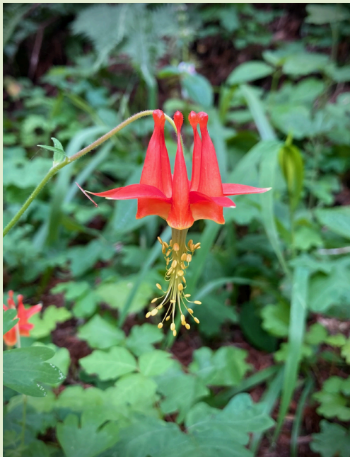
Aquilegia formosa (Western Columbine)