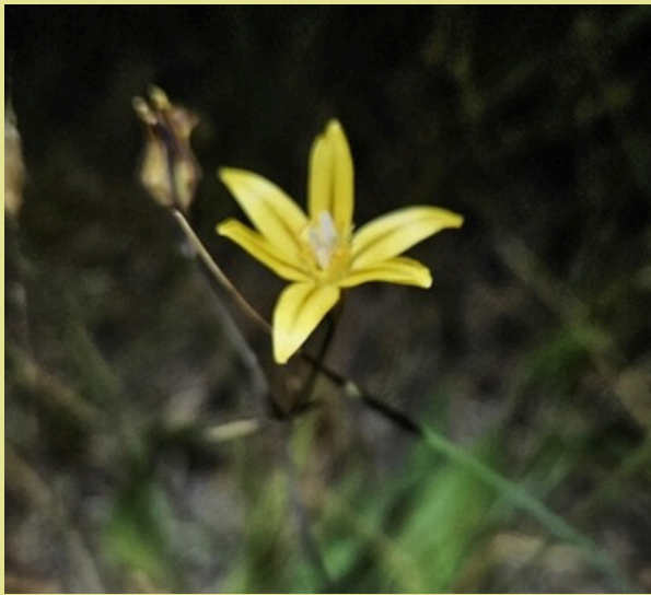
Tritelia ixioides (prettyface)

Our recent rains have finally encouraged our bulbs to wake up and rise out of their winter dormancy. We love seeing their first leaves pop out of the soil, and we eagerly await their glorious display of blooms!